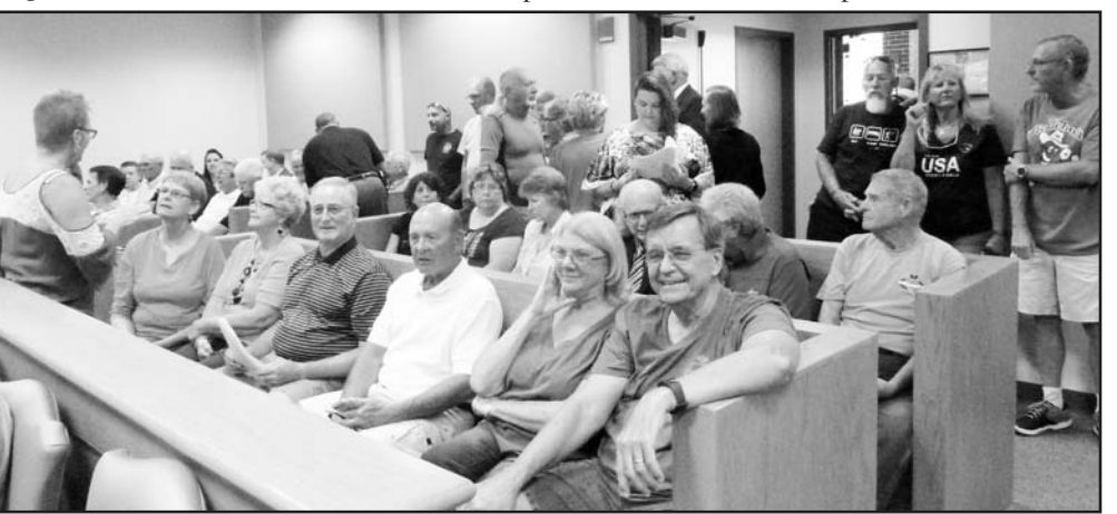
Some of the members attending the meeting